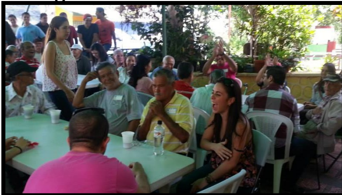
Albergue de abuelitos Tirrases