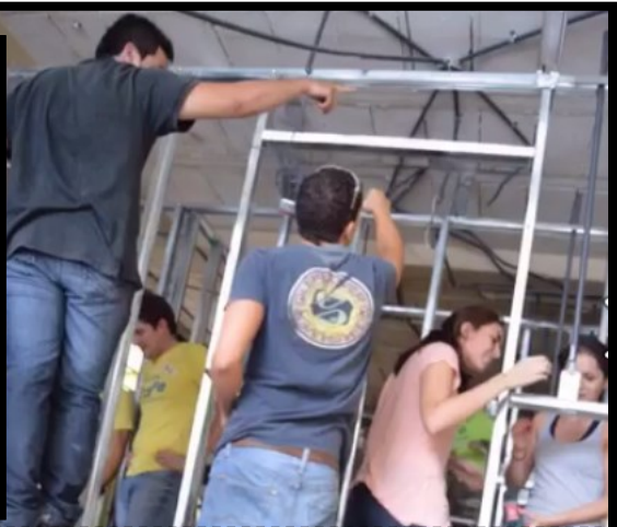
Centro de Restauración Guadalupe