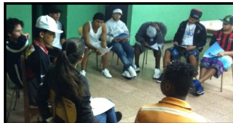
Carcel de Menores